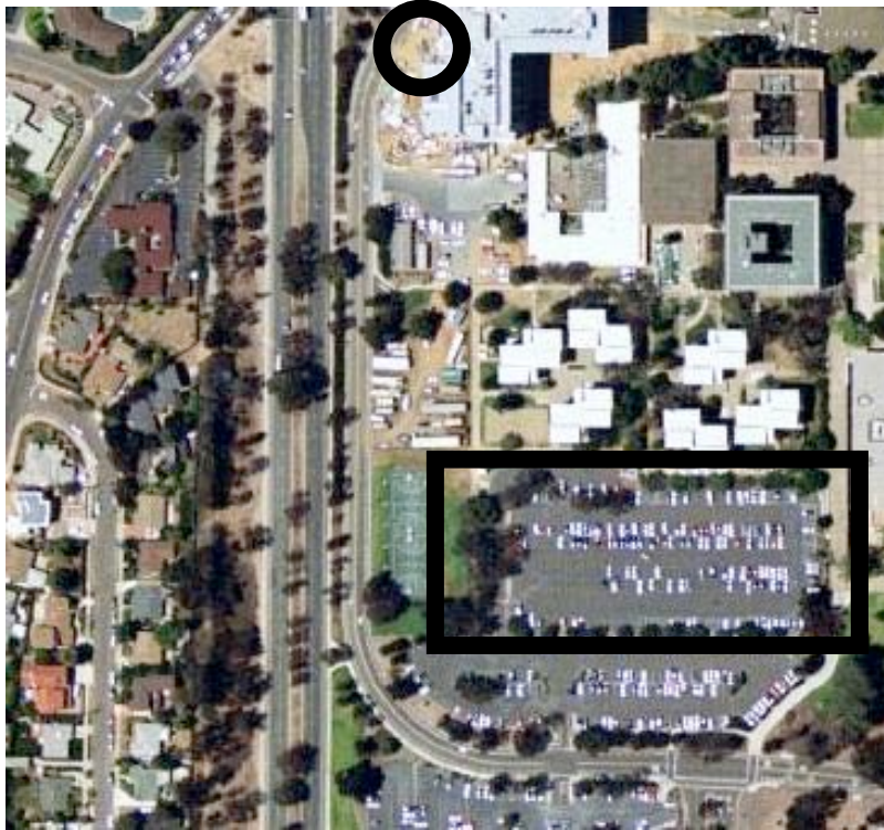
This is an aerial view showing the parking lot. The circle marks the lecture hall.