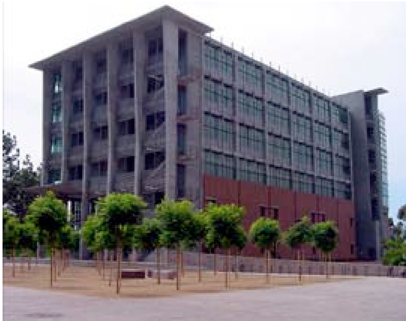
The Natural Sciences Building