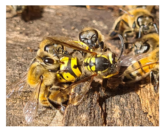
Figure 2. Three honey bees (Apis mellifera) at their hive entrance grabbing a wasp (Vespula germanica).